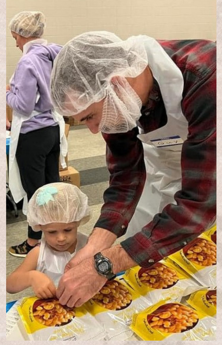
WHEN: Sat.-Dec. 7th 1st shift: 9-11 a.m. 2nd shift: 11-1p.m. WHERE: Sand Hills Event Center (4601 N Plum St, Hutchinson, KS)